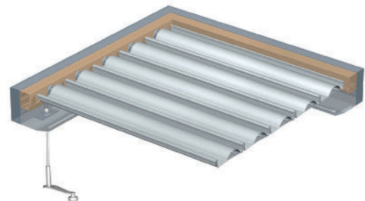
HAND OPERATED SPIRAL PIVOT

The roofs can be operated with ease, with the crank handle being detachable for storage when operation is complete.