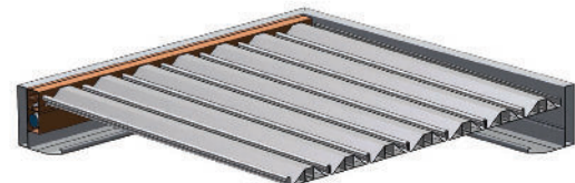
DOWN UNDER SPIRAL PIVOT

With neither operating mechanism nor motor to be seen Down-under provides for the cleanest look imaginable. Now available on request on all Opening Roofs.