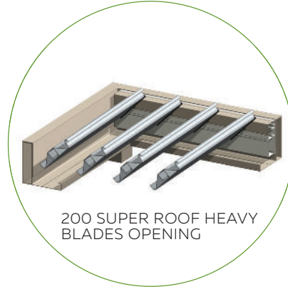
200 SUPER ROOF HEAVY BLADES OPENING