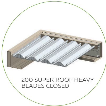
200 SUPER ROOF HEAVY BLADES CLOSED