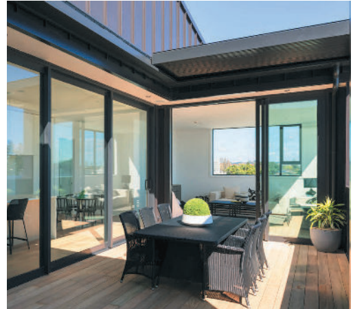
NORTH AUCKLAND, NZ

The 220/45 SUPER RETRACT has a matching standard Opening Roof blade in the NEW 200 SUPER ROOF. This blade is identical in design but 200mm long matches our standard Opening Roof centres (not 220mm as is the Retract). Both blades very compatible.