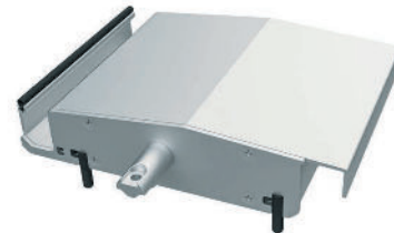
220/45 SUPER RETRACT BLADE