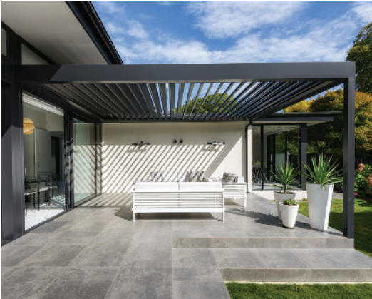
OUTDOOR ROOM CREATION