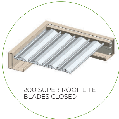
200 SUPER ROOF LITE BLADES CLOSED