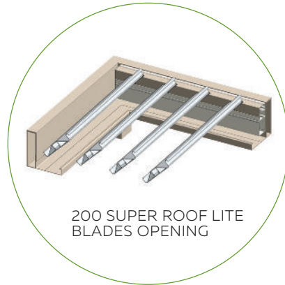
200 SUPER ROOF LITE BLADES OPENING