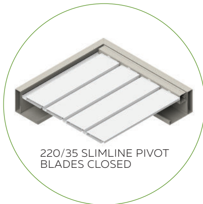
220/35 SLIMLINE PIVOT BLADES CLOSED