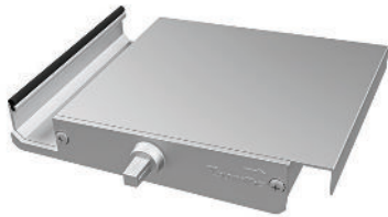
220/35 SLIMLINE PIVOT BLADE

The blade used by this 220/35 SLIMLINE PIVOT Opening Roof is also available as a Retract Roof. The 220/35 SLIMLINE PIVOT is ideal to use stand alone or on multiple panel installations combining Retract and Standard Opening Roofs.