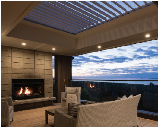
OUTDOOR LIVING YEAR ROUND