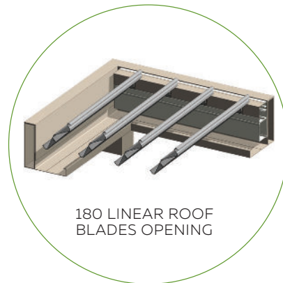
180 LINEAR ROOF BLADES OPENING