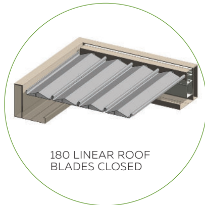
180 LINEAR ROOF BLADES CLOSED